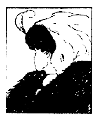
Figure 1. "Young woman/old woman" ambiguous figure.

Gergeley, Nádasdy, Gergeley, & Szilvia, 1995; Premack, 1990).