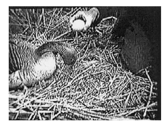
Figure 2. Greylag goose in the process of continuing egg-rolling movements after the egg is removed.

The consequences of looking at behavior through different theoretical preferences through "glasses" with different prescriptions can be illustrated by looking at some examples of behavior and comparing what you see with what psychologists have said they see when looking at the same behavior. One classic example of behavior that has been carefully described by psychologists is the egg-rolling behavior of the greylag goose. You can see this behavior for yourself in a short video segment that is available on the Internet.<sup>1</sup> A still from the video is shown in Figure 2.